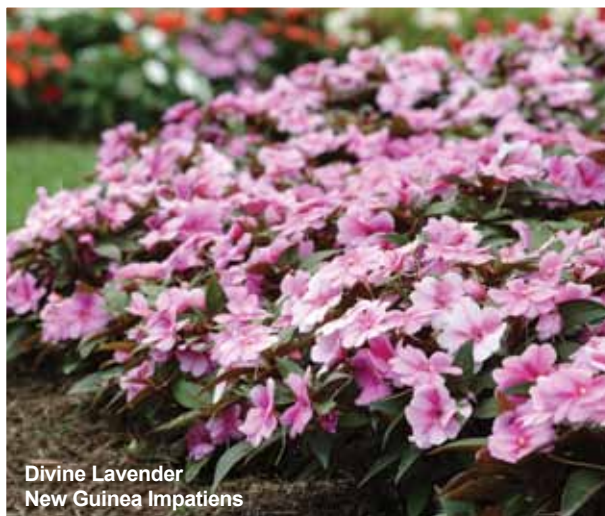
Divine Lavender New Guinea Impatiens

New Guinea Impatiens Don't worry... we're not affected by Impatiens Downy Mildew!