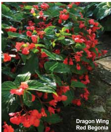
Dragon Wing Red Begonia